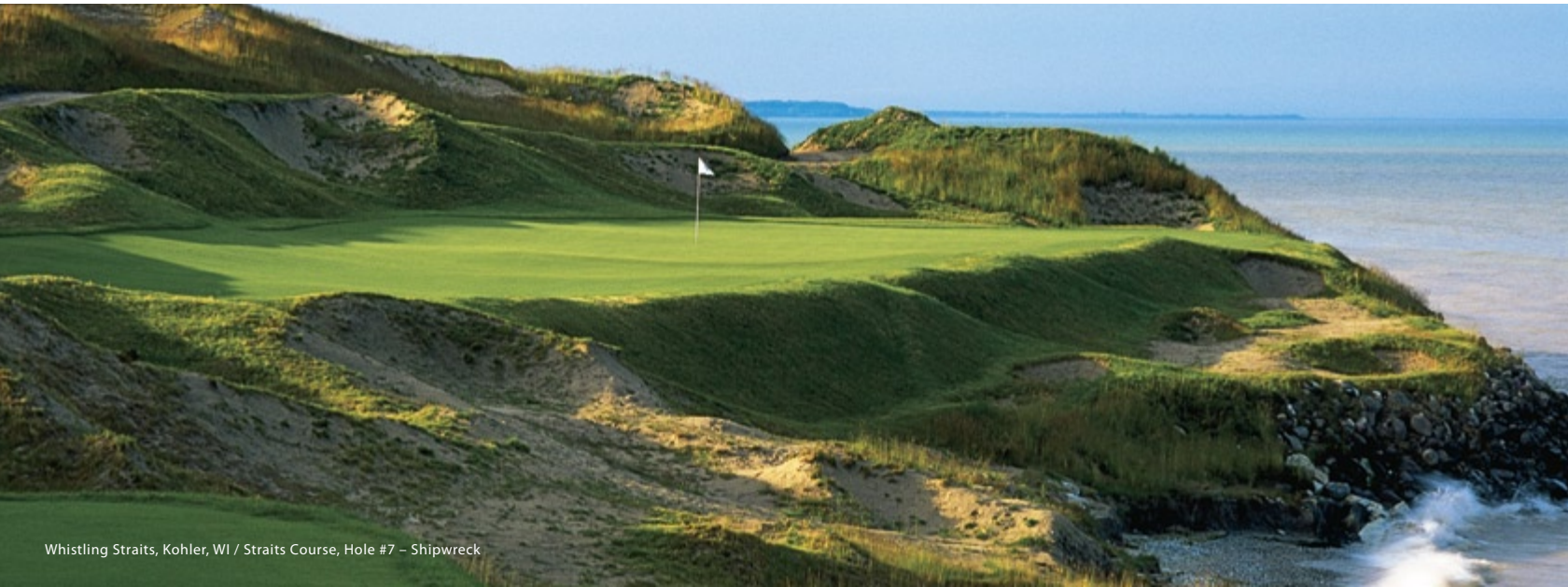
Whistling Straits, Kohler, WI / Straits Course, Hole #7 – Shipwreck